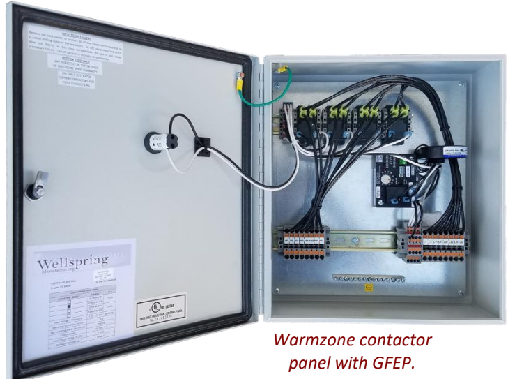
Warmzone contactor panel with GFEP.