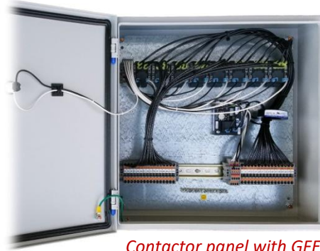
Contactor panel with GFEP