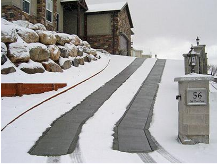
Driveway with ClearZone heated tire tracks